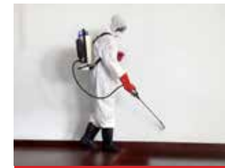
Specialised Cleaning and Disinfection