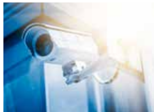
Electronic Security Solutions