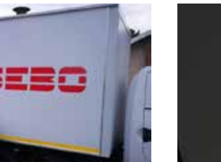
Vending and Beverage Solutions Support for Essential Services