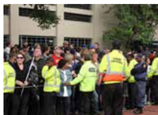
Crowd Facilitation and Secure Vehicle Movement