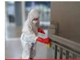
Disinfecting of Critical Touchpoints