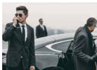
Risk Management, e.g. Close Protection Officers