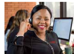
Remote Monitoring and Call Center Management