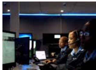
National Control Centre, with off-site Monitoring Capabilities