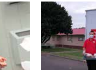
Delivery of Emergency Meals and Groceries to the Elderly and Other Vulnerable Communities