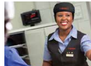
Catering Solutions for Essential Services, e.g. Healthcare Facilities, Quarantine Centres and Medical Staff Accommodation

We continue to implement our Good Manufacturing Practices and high Food Safety Standards by providing catering and vending services to our essential services customers. Our team of registered dietitians continuously adapt our customer menus to ensure the right balance of nutrients to support the immune function.