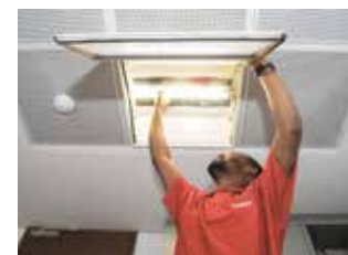
Facilities Management Solutions for Essential Services, e.g. Hospitals and Banks

Tsebo Facilities Solutions continues to support our customers, from enhanced Engineering, Energy and Maintenance to Facilities Management for essential services customers, and basic maintenance for customer sites that are closed as required. We provide a fully consultative process, bringing together the experience of our facilities, engineering, catering, cleaning, procurement, security and energy divisions to define and deliver tailor-made remote site/camp solutions.