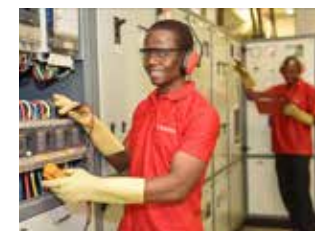
Engineering, Energy and Maintenance Services