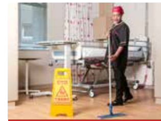
Cleaning Solutions for Essential Services, e.g. Healthcare and Quarantine Centres

Tsebo Cleaning and Hygiene Solutions is well equipped and experienced to offer tailored services to help your organisation reduce your risks in line with guidelines from the Centre for Disease Control, from offering full-service hygiene support to your staff to deploying specialised COVID-19 cleaning teams to clean and disinfect buildings.