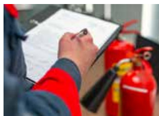
Other Specialised Services, e.g. Risk Consulting and Fire Management